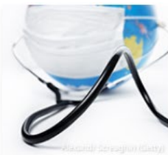
Environmental and Public Health