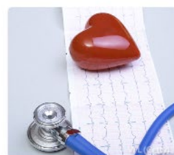
Conditions and Diseases