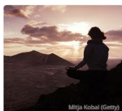
Health and Well-Being