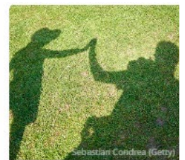
Children, Youth and Families