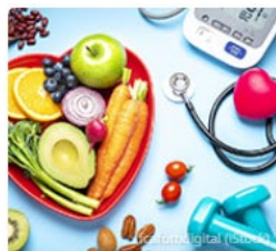
Food, Nutrition and Exercise