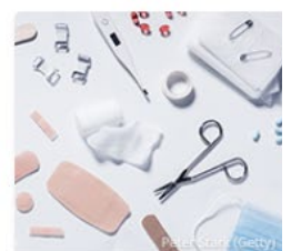
Drugs - English and Spanish