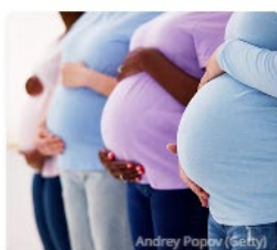
Pregnancy and Childbirth