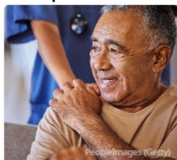
Health of Older Adults